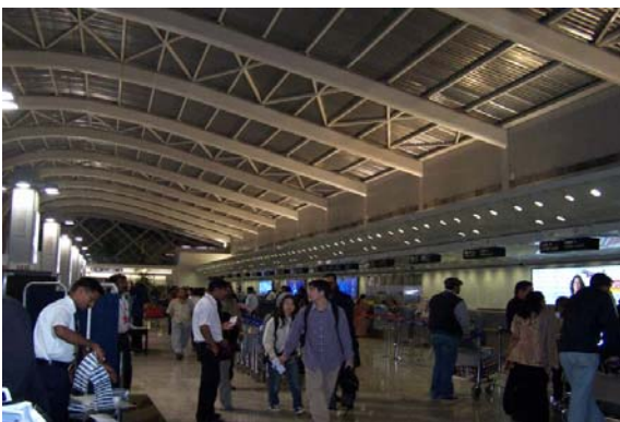
New Duty Free Concession for Mumbai

A joint venture bid of around $100m from the Indian Tourism Development Corporation ITDC/Aldeasa joint venture has won the three-year Mumbai (Bombay) International Airport (MIAL) duty free contract.