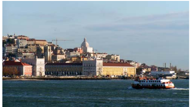
The beautiful city of Lisbon looks finally set for a new airport at Ota but only in 2017.

The work, announced in November 2006 will increase the available capacity of the airport to 16 million, providing enough facilities until the new airport comes on stream. The overall cost of this interim scheme is around €380m.