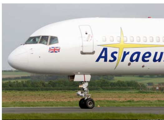
Weekly Astraeus flights from London Gatwick and Manchester

Cape Verde, once the domain of only German and Italian Tour Operators, has at last opened up to the UK market with weekly direct services from London Gatwick and Manchester. Astraeus launched their programme in November 2006 with passengers now able to fly to the large airport at Sal. Tourists can take an array of small connecting flights to neighbouring islands with local carrier TACV using modern ATR42 aircraft.