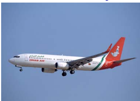
A New Oman Air 737-800 on approach to Muscat

The Sultanate of Oman will see a new era of airport expansion as the airport at Muscat makes progress on a major new development project. The plan will include a second runway and new mid-field terminal building designed to deal with additional traffic and high numbers of transfer passengers.