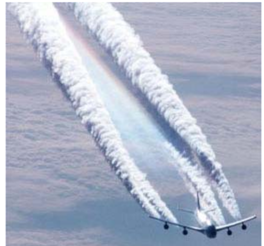
The pressing environmental agenda for the whole of the airline industry

A well-designed emissions trading scheme could be an environmentally beneficial solution but perhaps a wider international approach is needed preferably through the International Civil Aviation Organisation (ICAO) rather than Europe alone. It is clear however that some regions may have to take a more urgent lead in developing measures to address climate change.