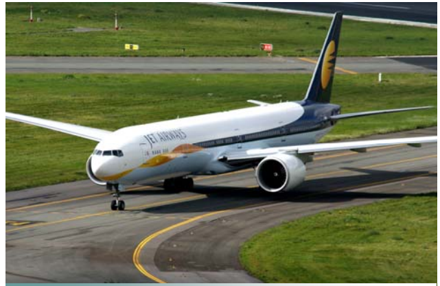
Jet Airways Airbus 330-200 en-route to Toronto via Brussels.

This is a much needed boost for Brussels airport which after a few years of slow growth has seen its traffic reach nearly 18 million passengers for 2007, up around 7% on the year earlier.