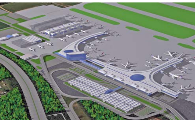
Terminal 3 at Sheremetyevo on stream for opening late 2008

An exciting year lies ahead for Aeroflot at Moscow Sheremetyevo Airport as they prepare for the completion and opening of the new Terminal 3 development. The facility which is near completion will give the carrier major productivity advantage as it at last brings its whole operation under one roof. This will enable passengers for the first time to travel between destinations within Russia and Internationally through the new transfer facility without having the time-consuming transit bus journey across the airport to Terminal 1.