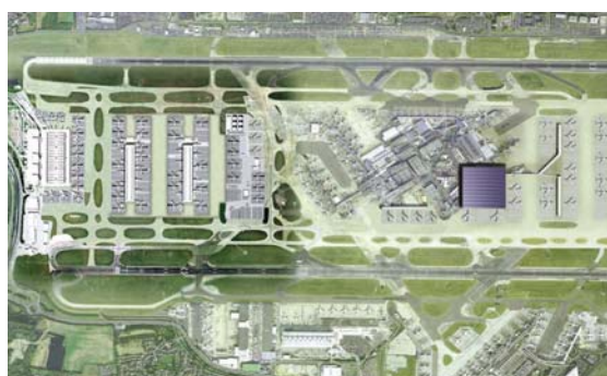
London Heathrow Airport will be rebuilt, refurbished or redesigned over the next 5 years

Over the next few years almost the entire London Heathrow Airport will be rebuilt, refurbished or redesigned. 2008 sees the much heralded opening of Terminal 5 with British Airways moving the majority of its flights to the Terminal. A major grouping together of other airlines by alliance will also take place with an estimated 60 airline moves predicted. The oneworld alliance will operate from Terminal 3, SkyTeam from Terminal 4 and the Star Alliance from Terminal 1. Terminal 1 itself will see a complete refurbishment during 2008.