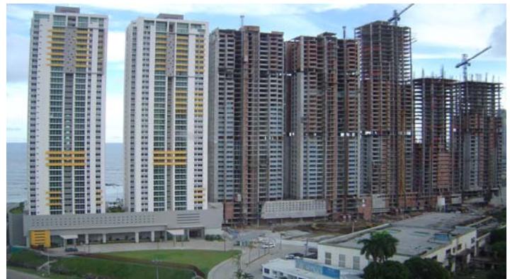
Real Estate Development - Panama style

The main airport for Panama at Tocumen has seen traffic grow at over 16% in the last year taking it to over 3.7million passengers. A former US airbase at Howard, approximately five miles from the City, has recently seen the UK company London & Regional Properties announce a deal worth $750 million to convert part of the base into a business park. The facility already has a long runway and is the declared alternate