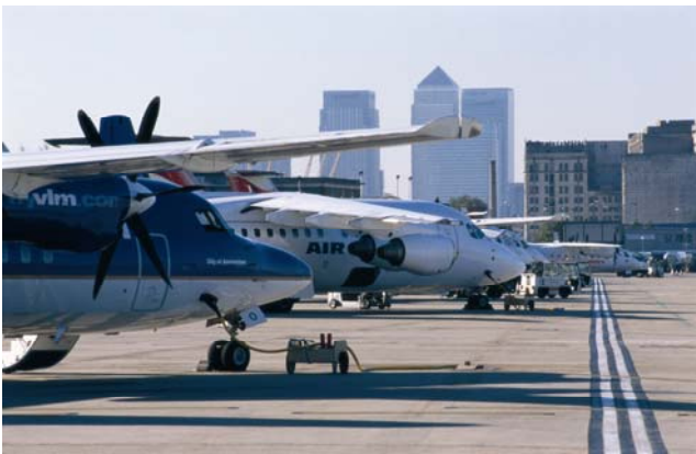
VLM, CityJet and Scot Airways come together at London City Airport

At a time when all attention was focussed on Alitalia, Air France/KLM have acquired the regional carrier VLM in what must be regarded as the European airline deal of the year. The Antwerp based airline which had a route network centred on London City Airport (LCY) as a hub for most of its flights, operated a fleet of 18 Fokker 50 aircraft and one BAE 146. It will link up with Air France subsidiary CityJet which also has extensive activity at London City. Indeed the acquisition will give CityJet, which also recently took over active LCY carrier Scot Airways, over 50% of the flights at the airport.