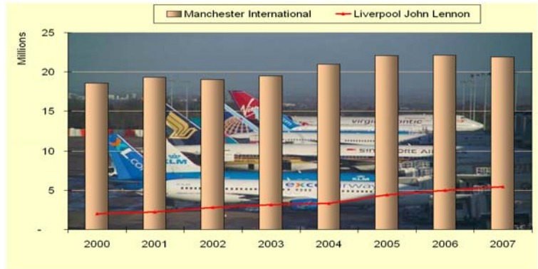
Manchester International has seen relatively slow traffic growth compared with its neighbour Liverpool John Lennon

The announcement also highlights there is spare capacity at Manchester and should enable the airport to grow without the costs of excessive regulation. Indeed passenger