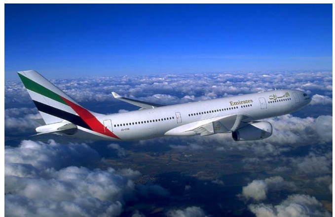
Emirates has started its North East of England service from Newcastle to Dubai

It appears that future initiatives are likely to focus on joint marketing initiatives with airports rather than direct financial support.